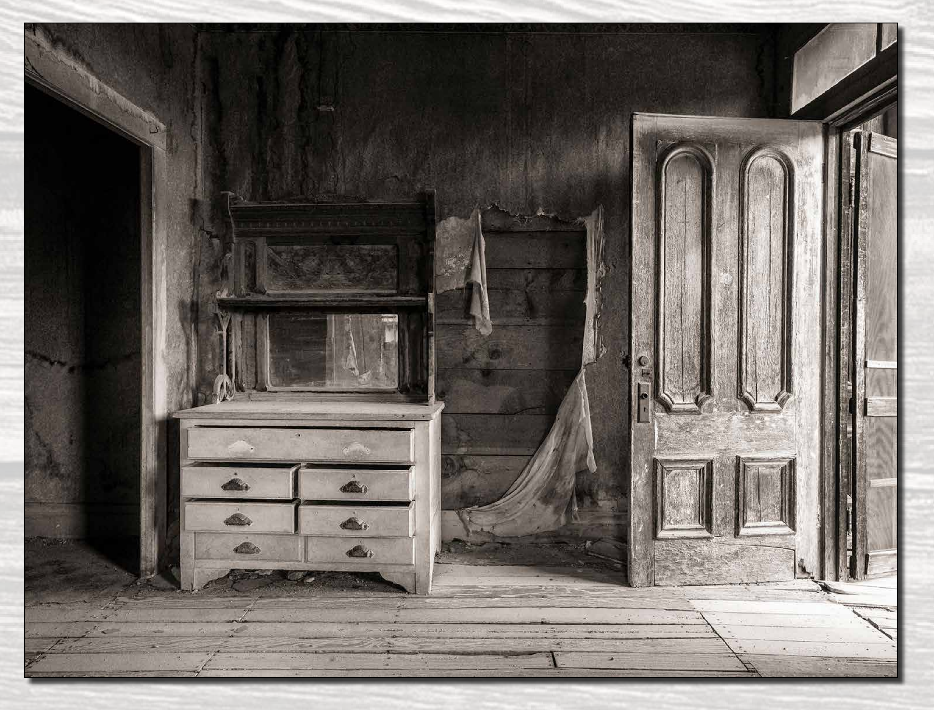
The Only Open Doors