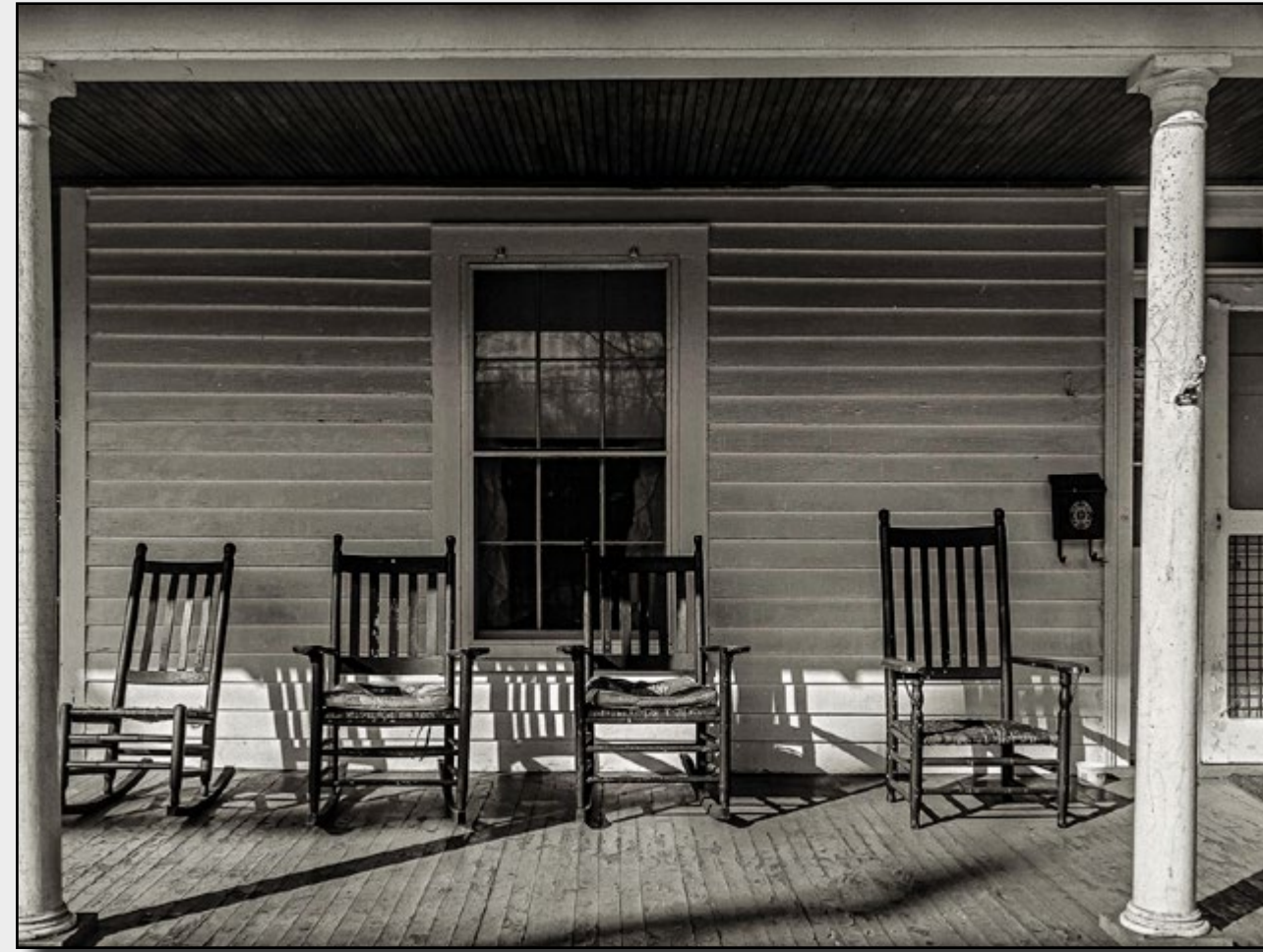
Come Set a Spell