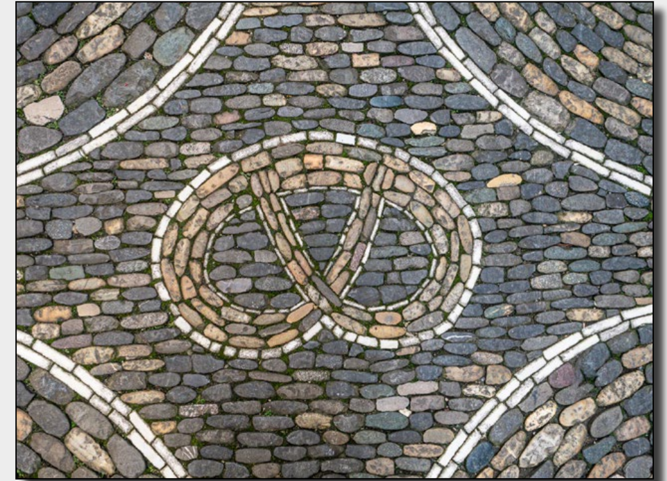
Written in Stone

This is the start of the third year of The Lipka Journal. Thank you so much for downloading and enjoying this publication and many others on my website. Your support and interest are greatly appreciated and an inspiration for this publications.