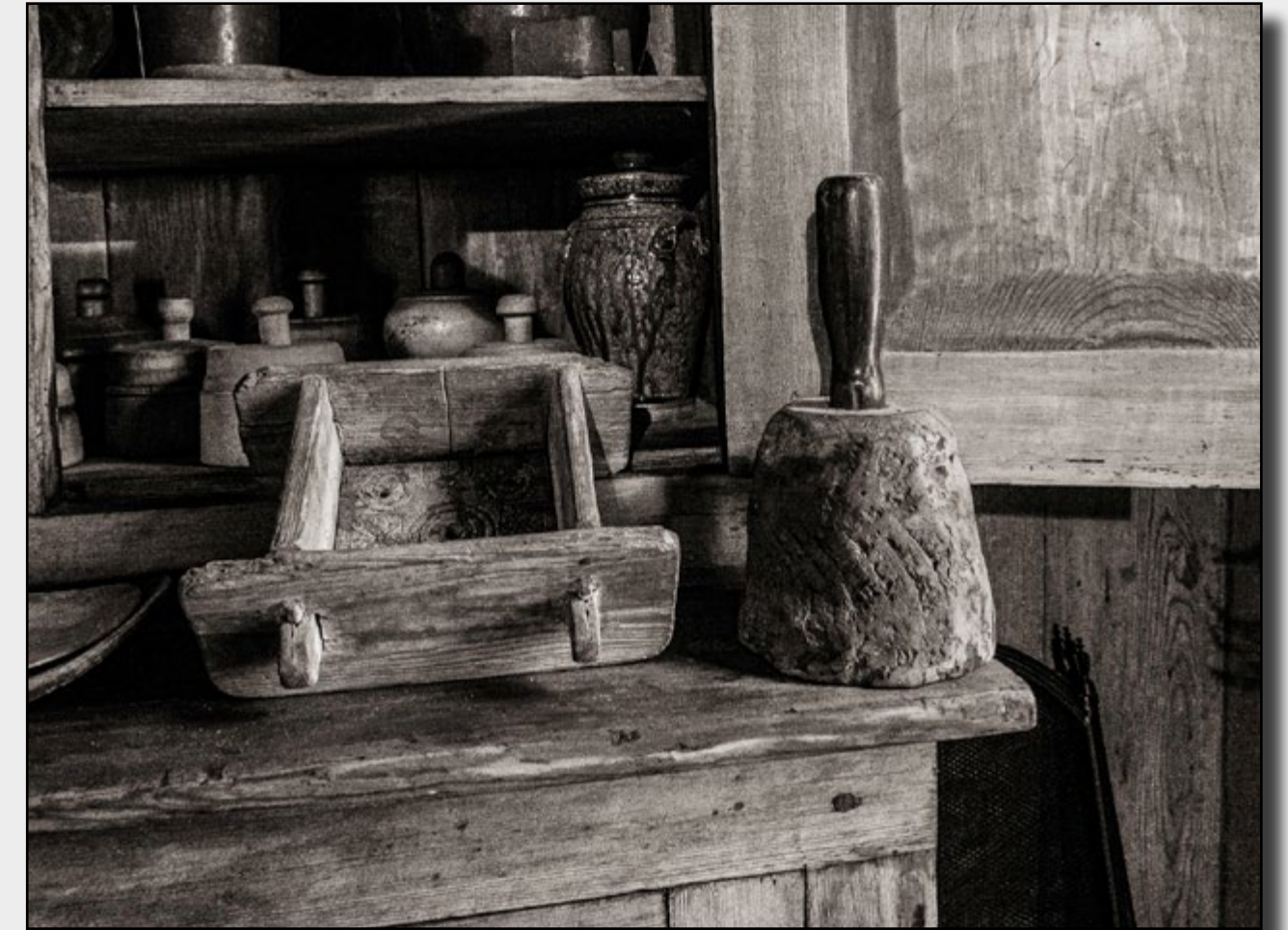
How It Was Done

Community, voluntary or not, is what we're seeing in this month's Journal. We start with a voluntary community; Benedictine Nuns following in the steps of their founder, Hildegard of Bingen. Among their earthly vocations is winemaking.