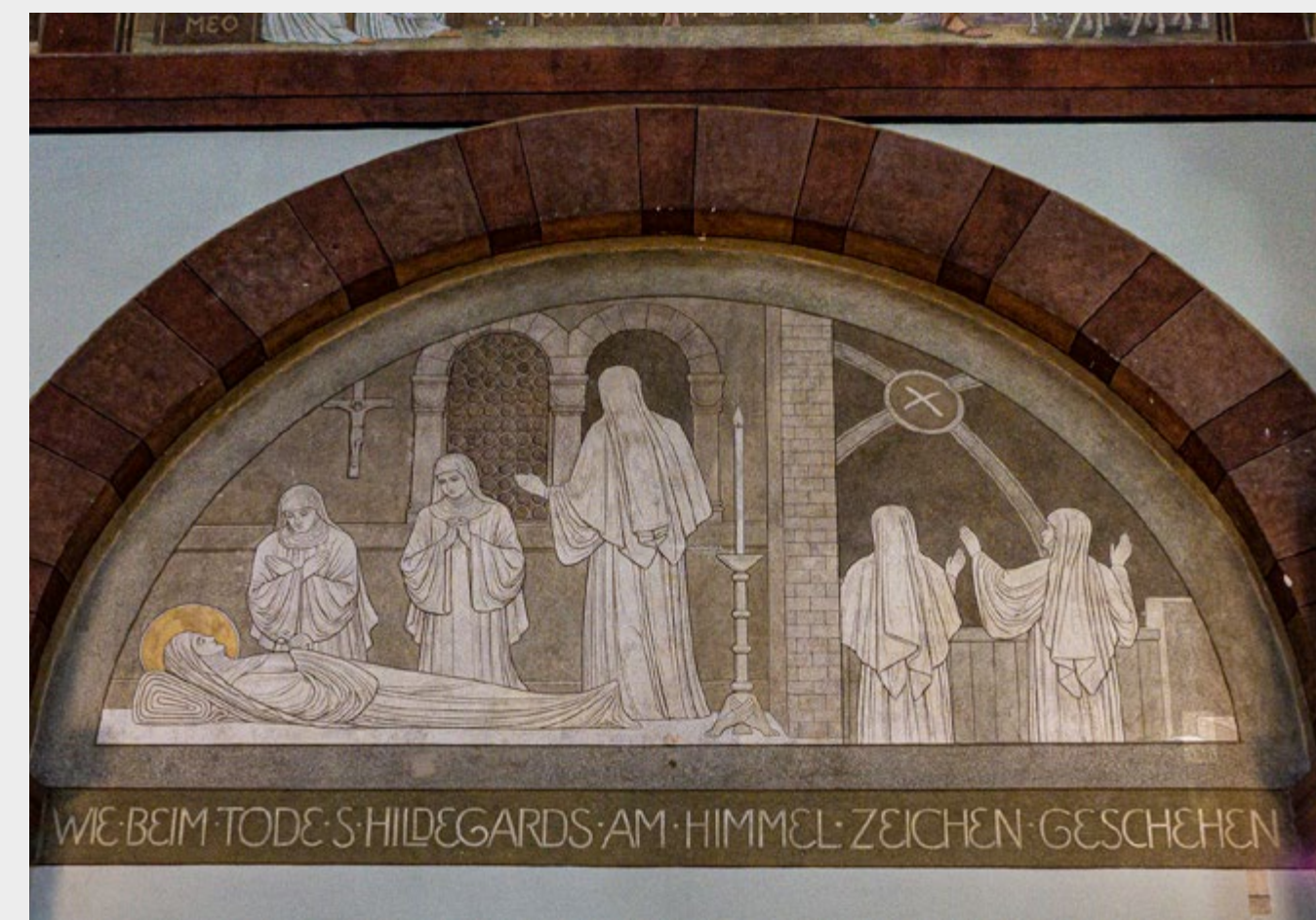
A Life in Murals