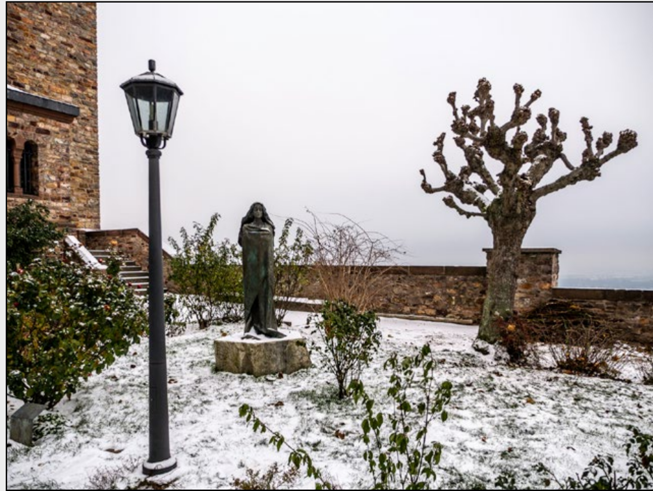
Hildegard of Bingen