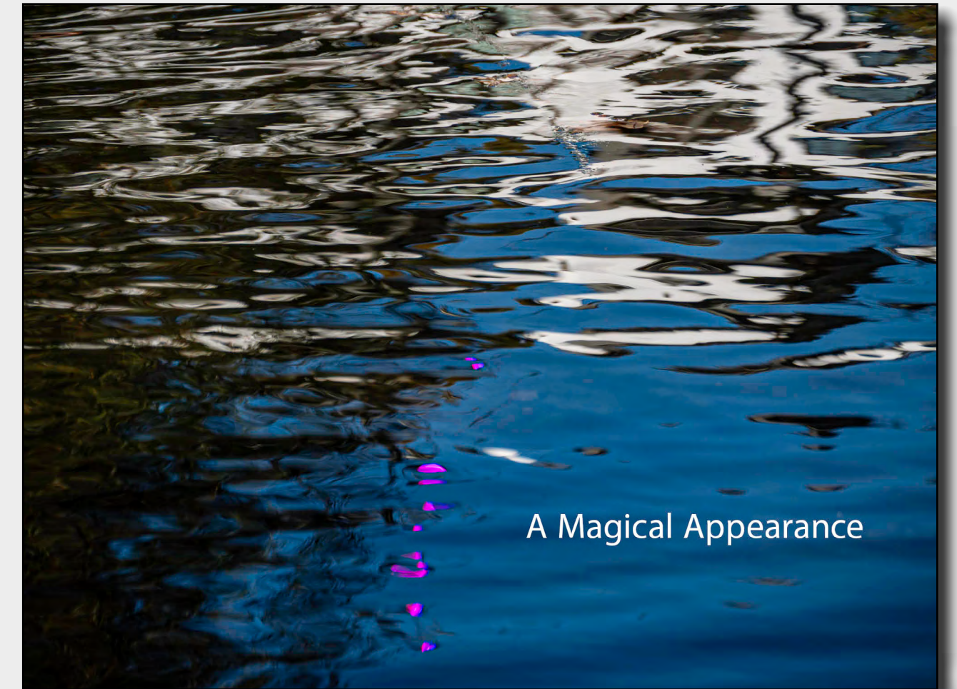
A Magical Appearance

A local gallery proposed a landscape show. I decided I had enough images to meet the five-image entry requirement. I found a lot more than five images. I picked out a bunch of images and then thought, why not put them all together in The Lipka Journal. So, here are some of the better landscape images I’ve created. And, for your edification and enjoyment, the images on Page 22, (Hell’s Half Acre), and the cover shot of Shiprock in Clouds became part of the exhibition.