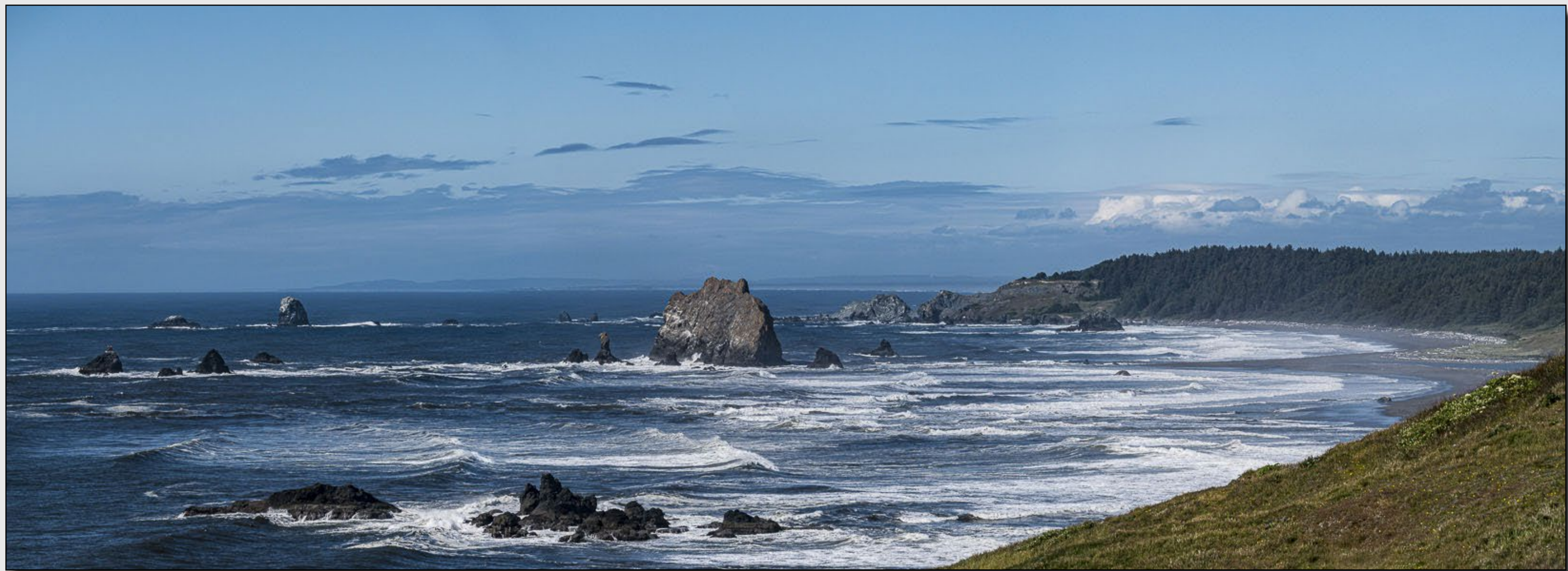
Along the Oregon Coast