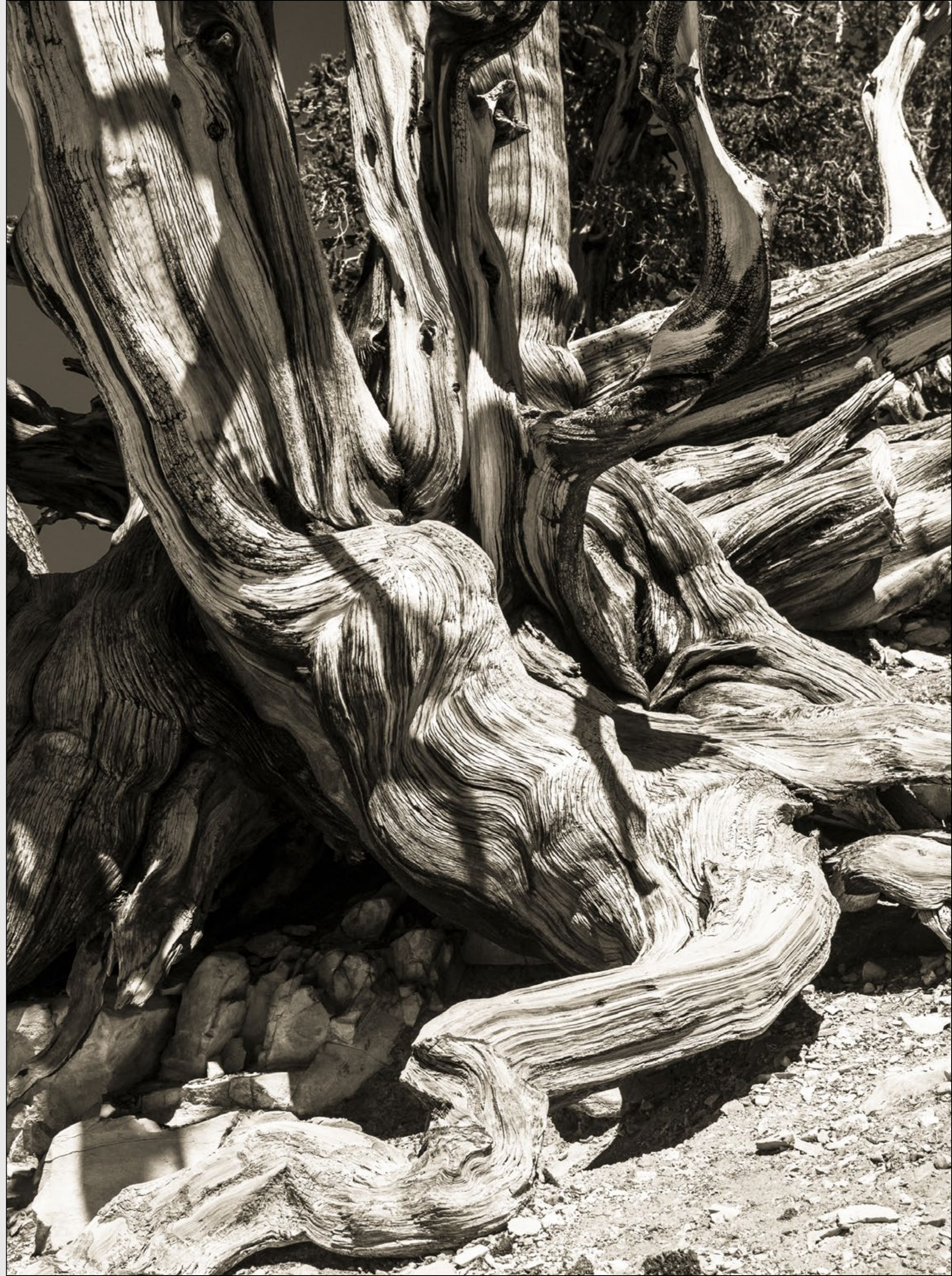
Bristlecone Pine Roots

I've gone way back to old photographs of my Volkswagen Beetle. There are photographs of some ancient trees; the Bristlecone Pines of Schulman Grove and Patriarch Grove. The new photographs are panoramic landscapes of the Oregon Coast made earlier this year.