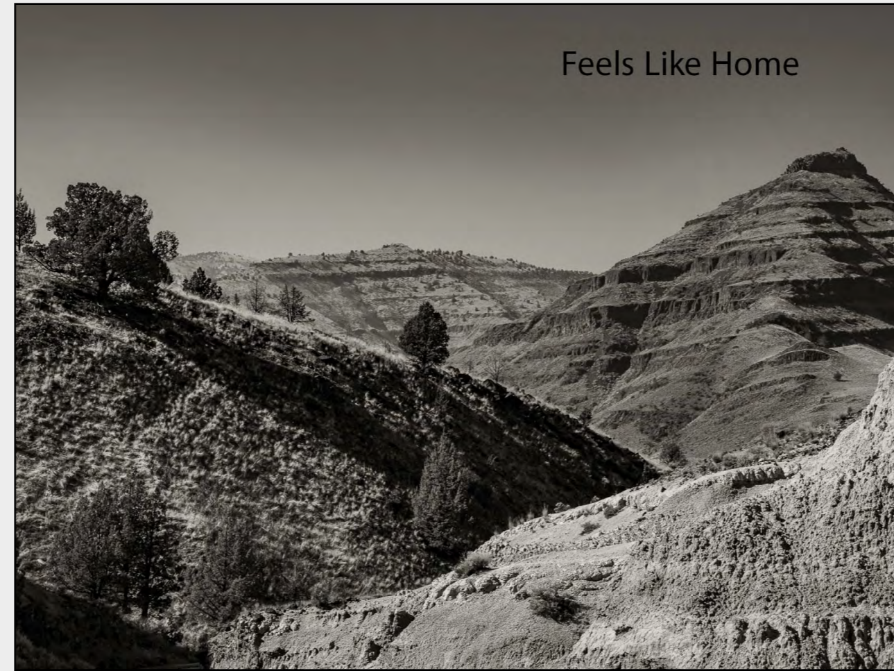
Feels Like Home