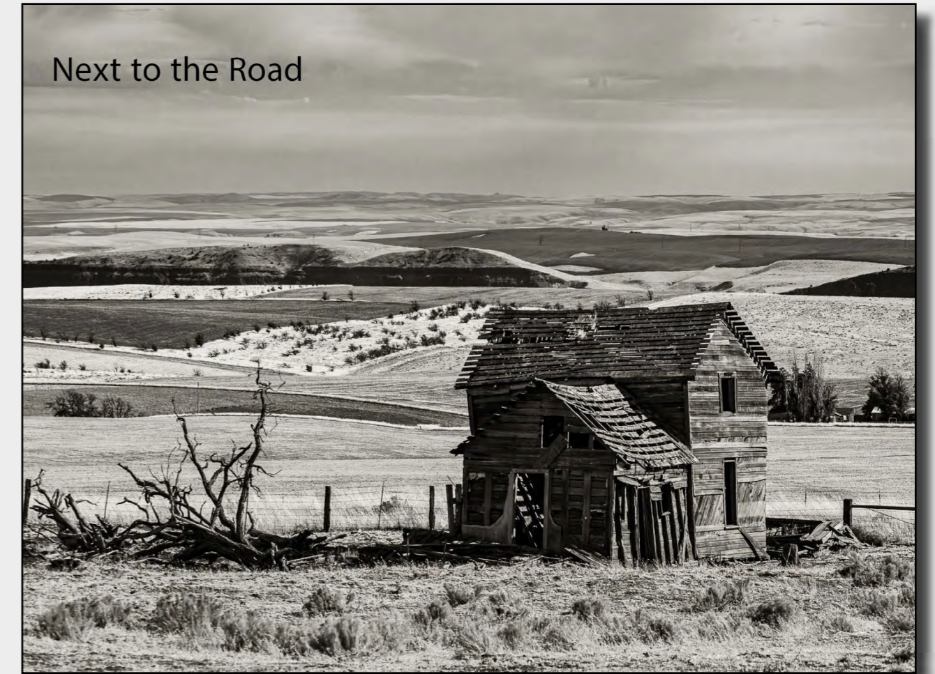
Next to the Road

This month I'm starting small and getting bigger. I'm looking at little things at Biltmore and then, we're heading to the wide-open spaces of the American West. I Feel Like Home in Central Oregon and then at the last minute I changed from a "close up" project to some more roadside structures all over the American West. That last folio was inspired by outtakes from Feels Like Home and just kind of magically appeared as I looked through my catalog of images. Art is like that. Sometimes is just happens without much of your input.